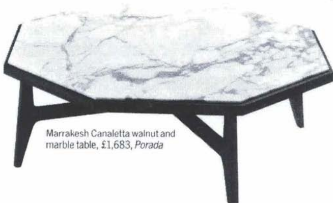
Marrakesh Canaletta walnut and marble table, £1,683, Porada