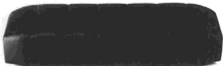
Galloti & Radice's minimalist foam polyurethane Cloud comes in velvet, leather or suede