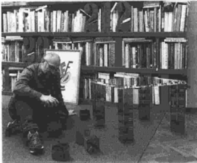
Clip Clap was part of Kartell's first children's collection