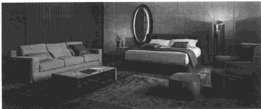
Flou's Borgonuove sofa, Essenza doors in larch, Softwing bed and armchair