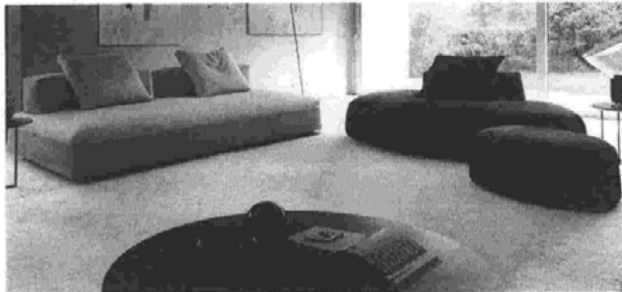
Desiree's Monopoli and Milos, an oval informal island with moveable backrest