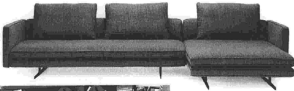
Arketipo went for a pared-back look with Moss