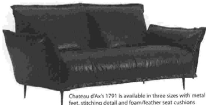
Chateau d'Ax's 1791 is available in three sizes with metal feet, stitching detail and foam/feather seat cushions