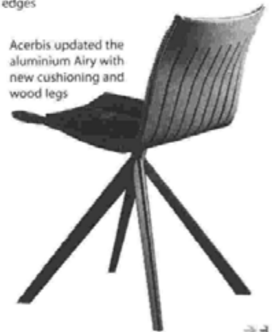
Acerbis updated the aluminium Airy with new cushioning and wood legs