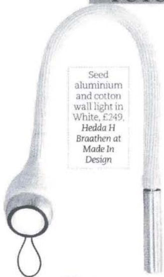
Seed aluminium and cotton wall light in White, £249, Hedda H Braathen at Made In Design