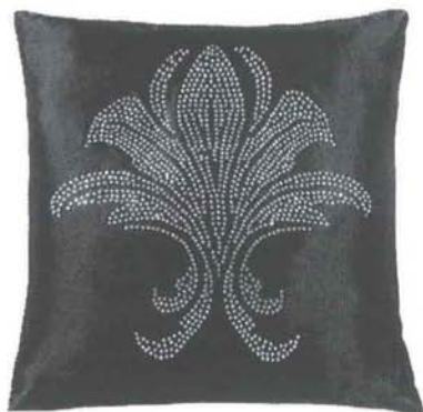
Tiara Square polyester cushion (40 x 40cm), £18, Laurence Llewelyn-Bowen at Littlewoods