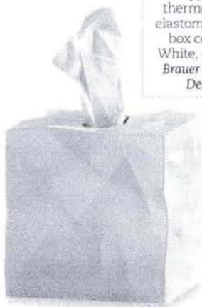
Wipy Cube thermoplastic elastomer tissue box cover in White, £18, John Brauer at Panik Design