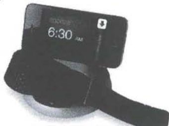
Lark Silent Un-Alarm Clock and Sleep Sensor for iPhone/iPad, £82.59, Amazon