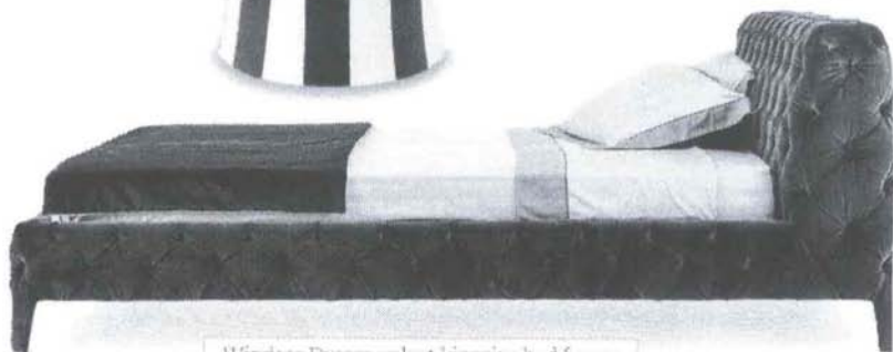
Windsor Dream velvet kingsize bed frame in Purple, £8,432, Arketipo at Aram Store