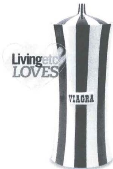
Viagra porcelain canister, around £105, Jonathan Adler